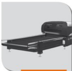
Loading/unloading tables with dual pallet