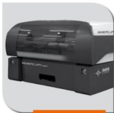
Class 1 safety enclosure with inspection windows