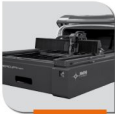
Fully cleared working area with fixed table